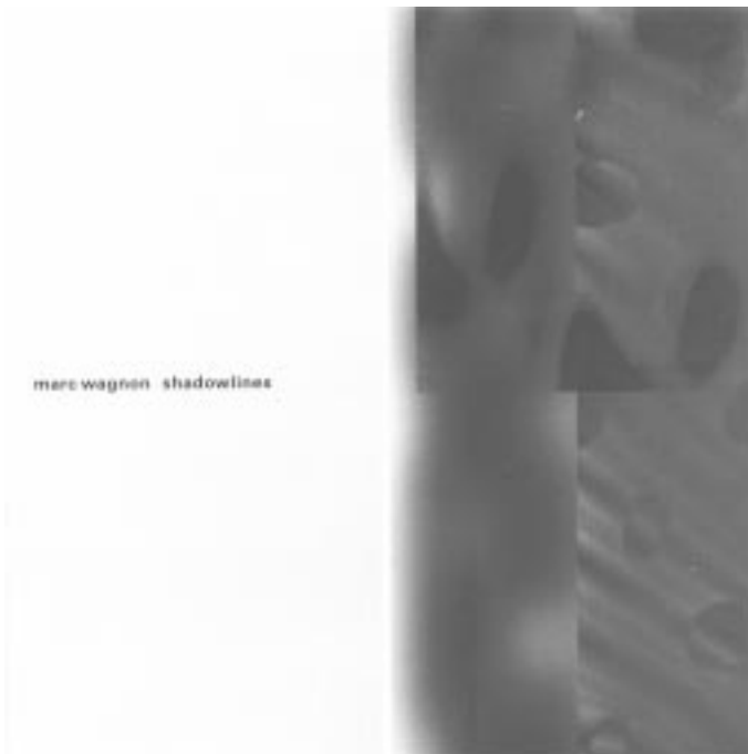
Marc Wagnon "Shadowlines"