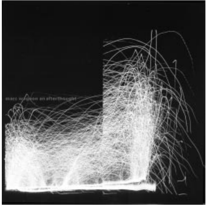
Marc Wagnon "An Afterthought"

Conjunction: Buckyball (CD) Records 2001